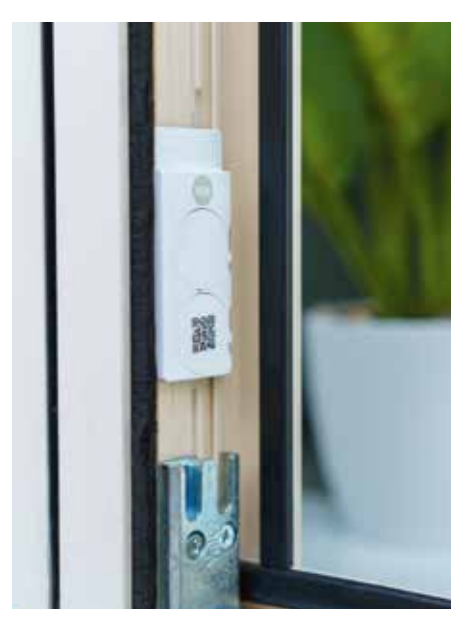
SensCheck™ compatible. Check the status of your home, anytime, anywhere.

There is a night vent facility on both the standard casement and flush casement windows, allowing you additional ventilation whilst the window is partially open.